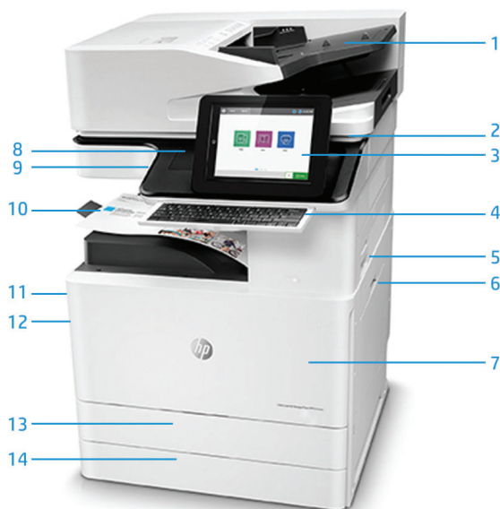
HP Color LaserJet Managed Flow MFP E87640z